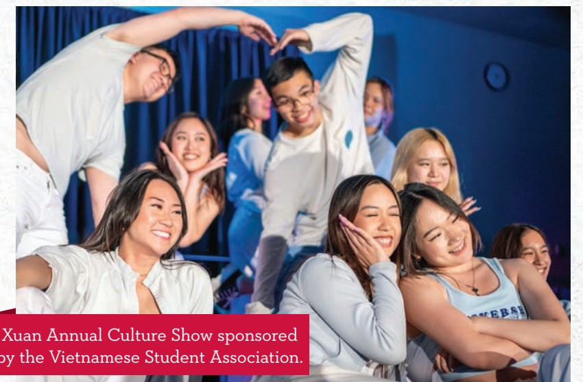
Xuan Annual Culture Show sponsored by the Vietnamese Student Association.