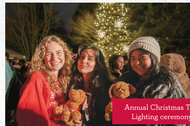
Annual Christmas Tree Lighting ceremony.