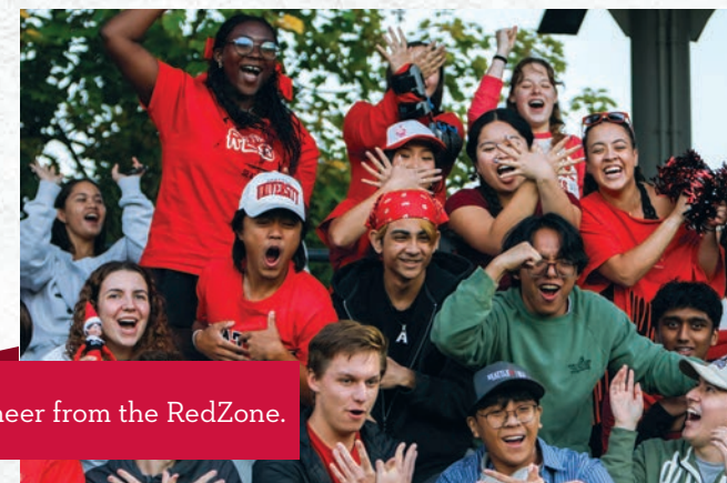
Cheer from the RedZone.