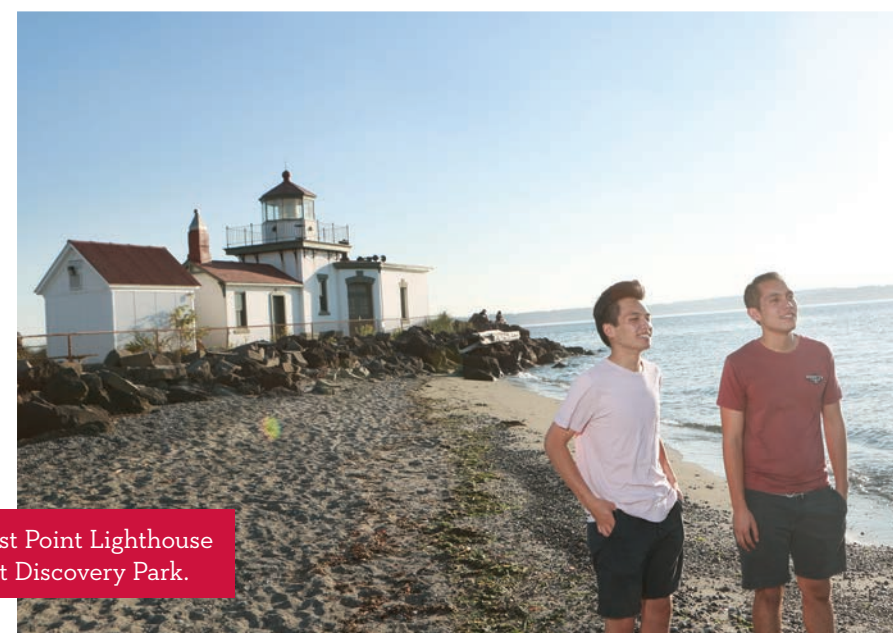
West Point Lighthouse at Discovery Park.