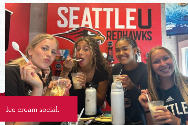
Ice cream social.