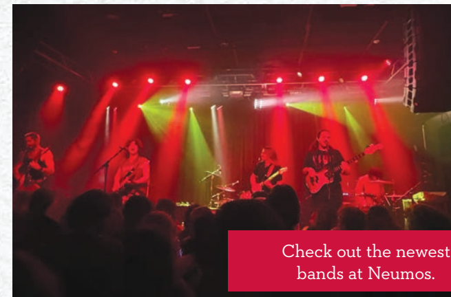
Check out the newest bands at Neumos.

No matter what you'd like to explore, there's a club, class or group ready to accompany you on your next adventure.