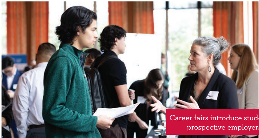
Career fairs introduce students to prospective employers.

placement rate (employed or in grad school within six months of graduation)