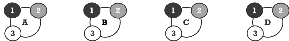
Figure 2: Learning groups

Students from each home group now have an equal amount of time to teach their material to their learn group. Remember to keep time and tell students when to switch to the next person. Circulate the room to check on understanding. At the end, you can review further or clarify misconceptions with the whole group.