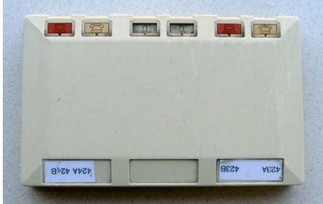
Typical BELL faceplate

Connect devices to the 'B' jacks with the red computer icon.