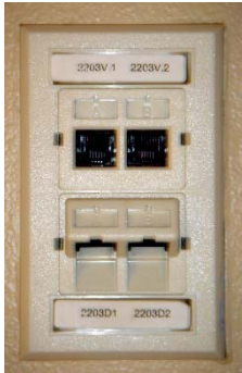
Typical ATMA faceplate

Connect devices to the bottom jacks where the label ends with 'D'.