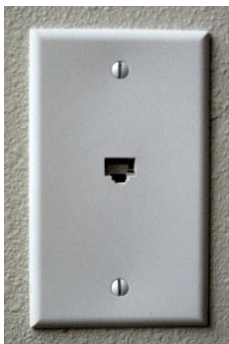
Typical DOUG faceplate

The network jacks are unlabeled. Connect devices to the pictured jack in either the bedroom or living room.