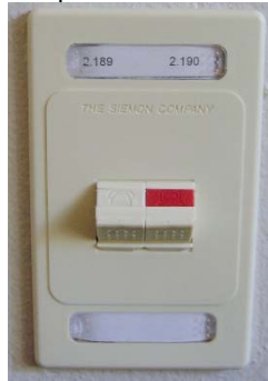
Typical CHDN faceplate

Connect devices to jacks with the red computer icon.