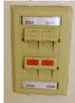
Typical XAVR faceplate

Connect devices to the 'B' jacks with the red computer icon.