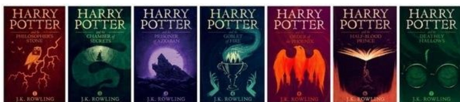
Suggested Reading (Harry Potter Novel Series)