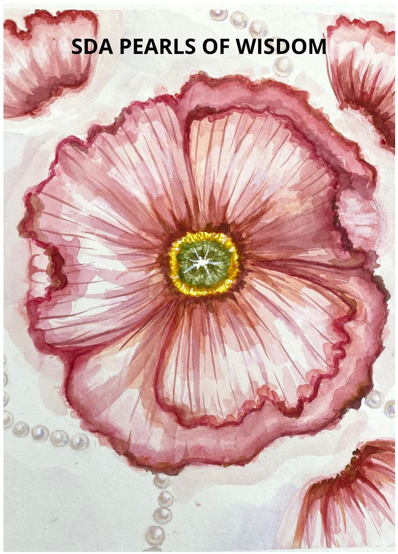
MAGIS: A STUDENT DEVELOPMENT ADMINISTRATION, VOLUME 17