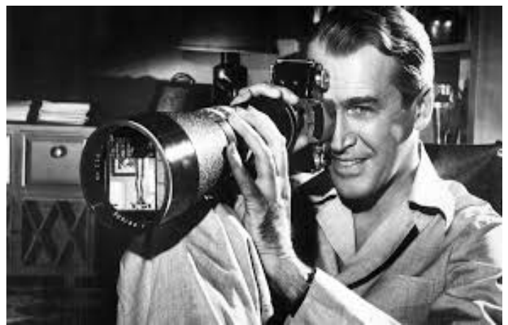
Jimmy Stewart as L.B. Jefferies watches his neighbors through a telephoto lens in Rear Window (Hitchcock, 1954).