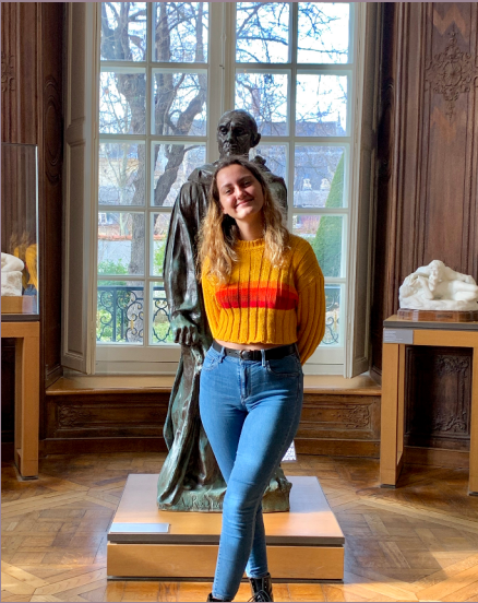
Musée Rodin; January 29, 2020