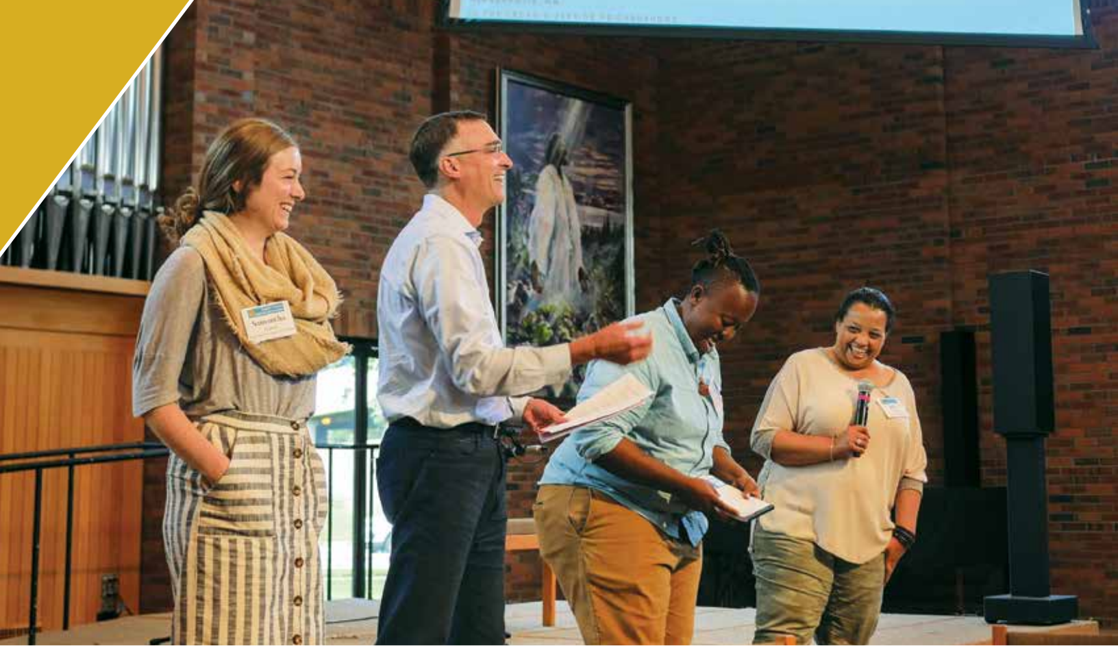
The Summer Institute was hosted by Augsburg University in Minneapolis.