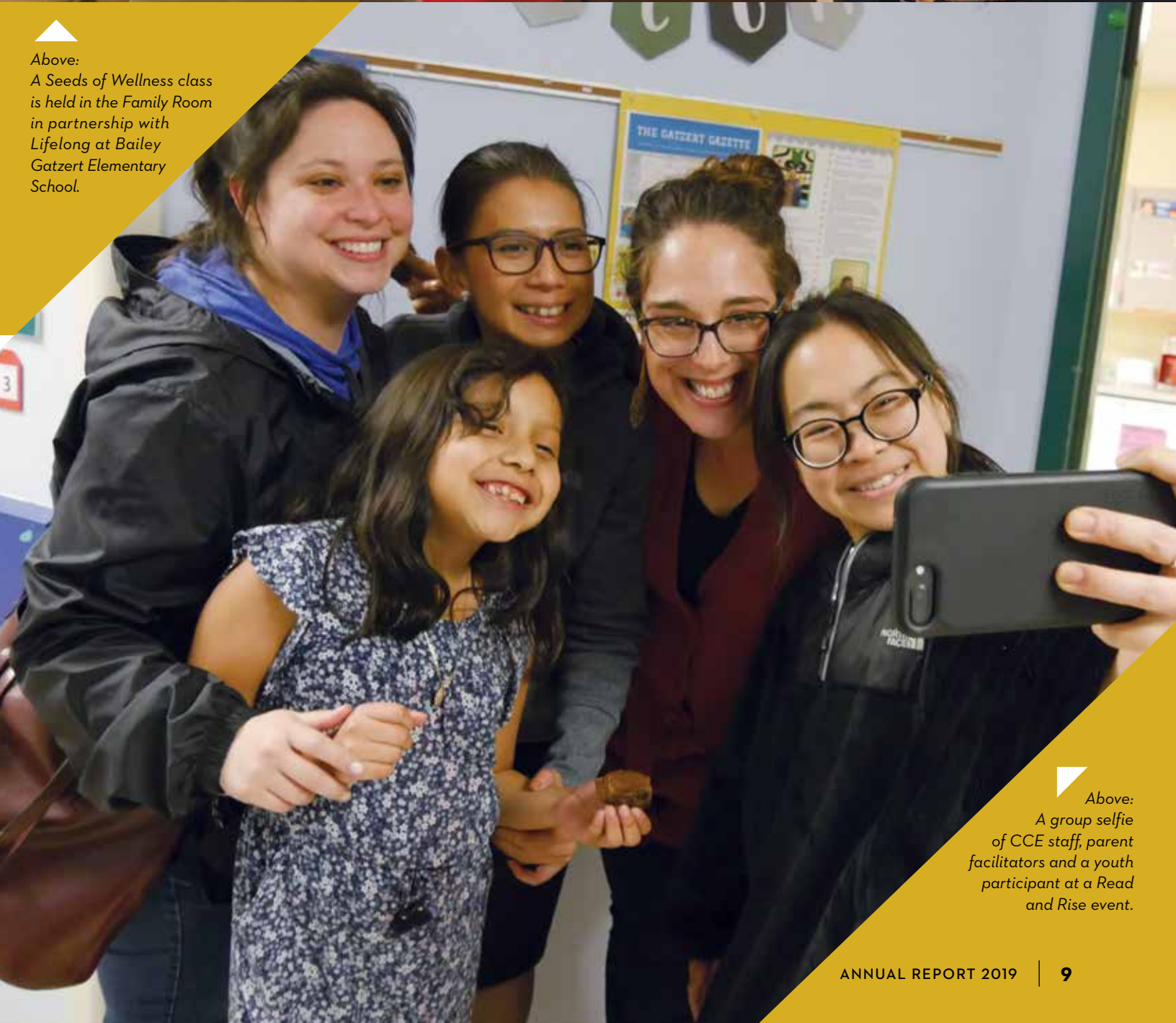
▲ Above: A group selfie of CCE staff, parent facilitators and a youth participant at a Read and Rise event.