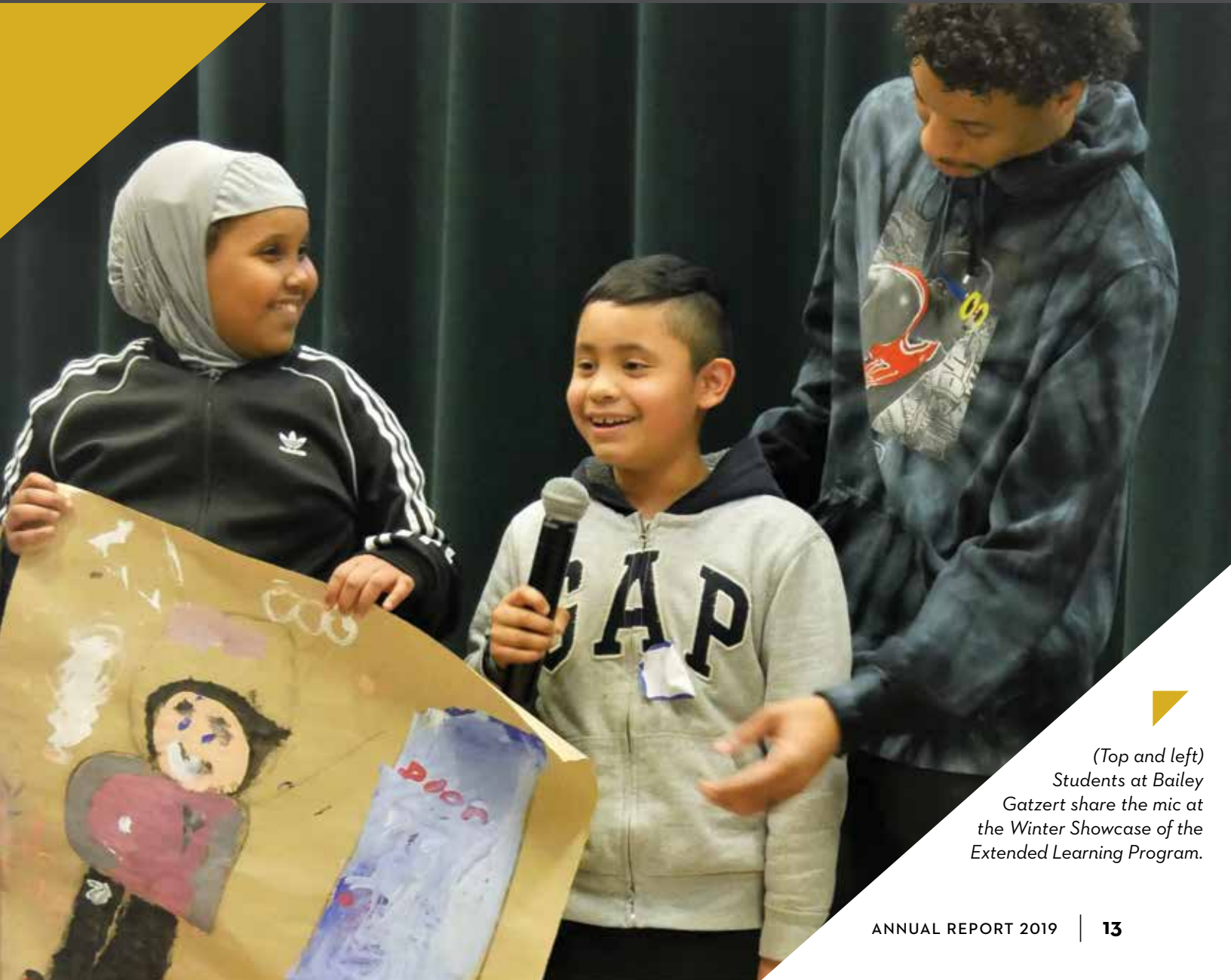
(Top and left) Students at Bailey Gatzert share the mic at the Winter Showcase of the Extended Learning Program.

GROWING OUR STEM IMPACT: In preparation for sharing space in the new Center for Science and Innovation (CSI), the CCE has convened science and engineering faculty to assess our community-engaged scholarship and teaching and forge new connections in the neighborhood.