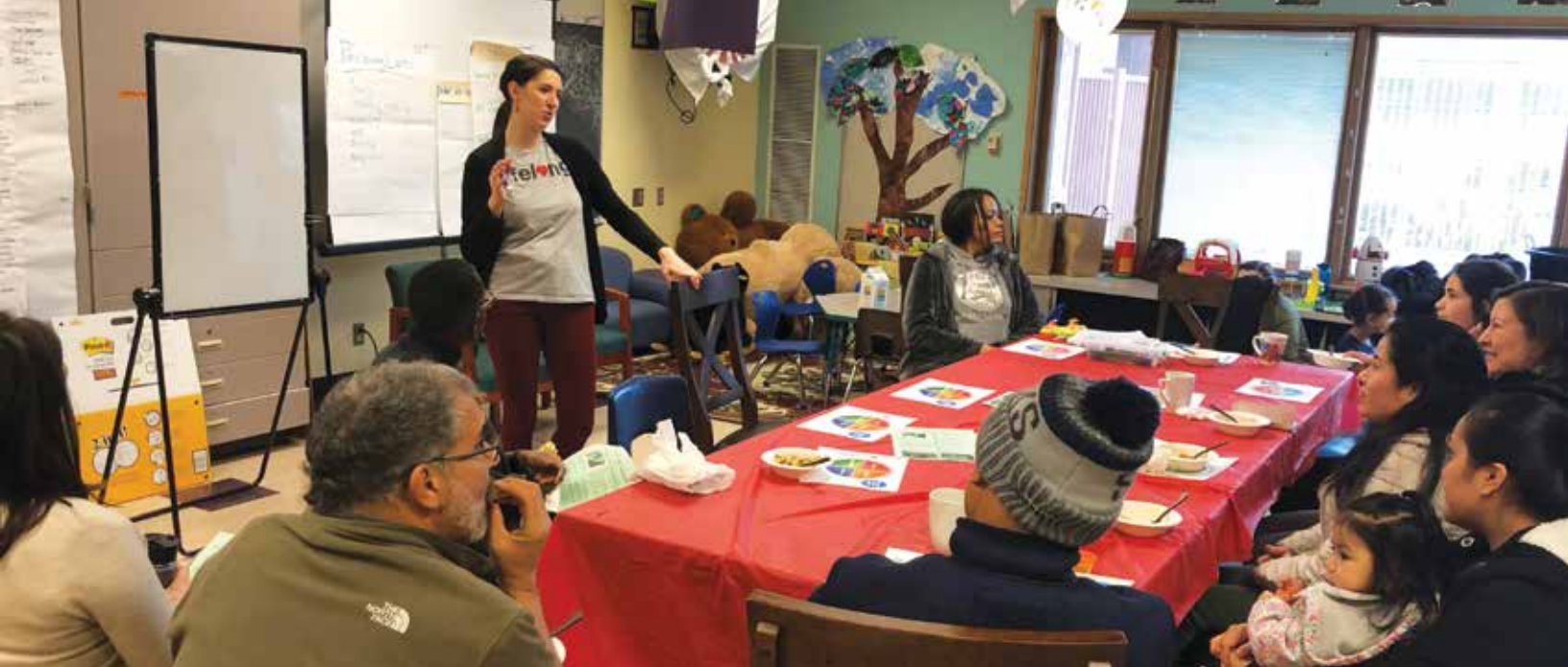
▲ Above: A Seeds of Wellness class is held in the Family Room in partnership with Lifelong at Bailey Gatzert Elementary School.