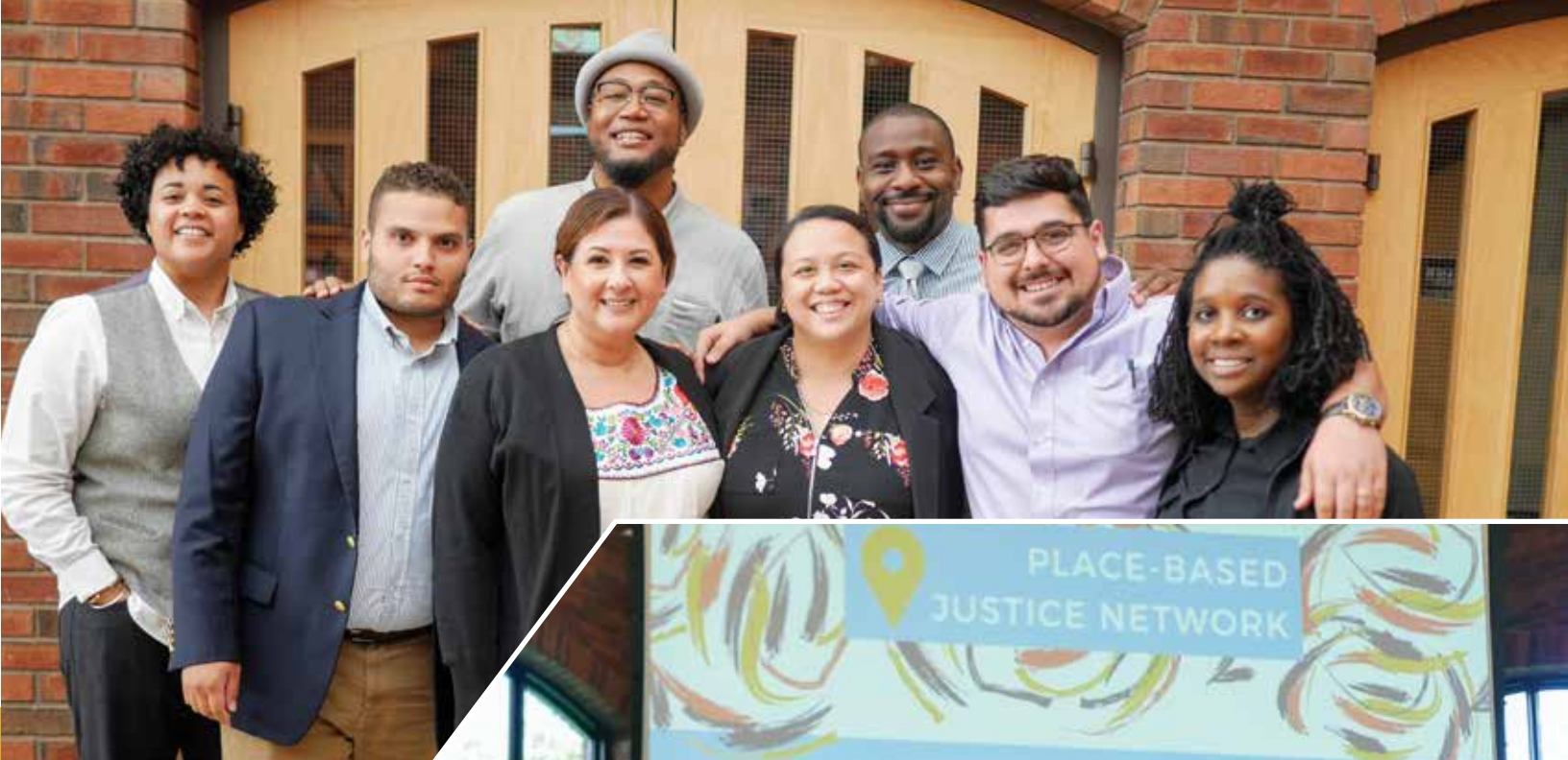
▲ Above: PBJN Next Generation Fellows gather for a pre-institute retreat.