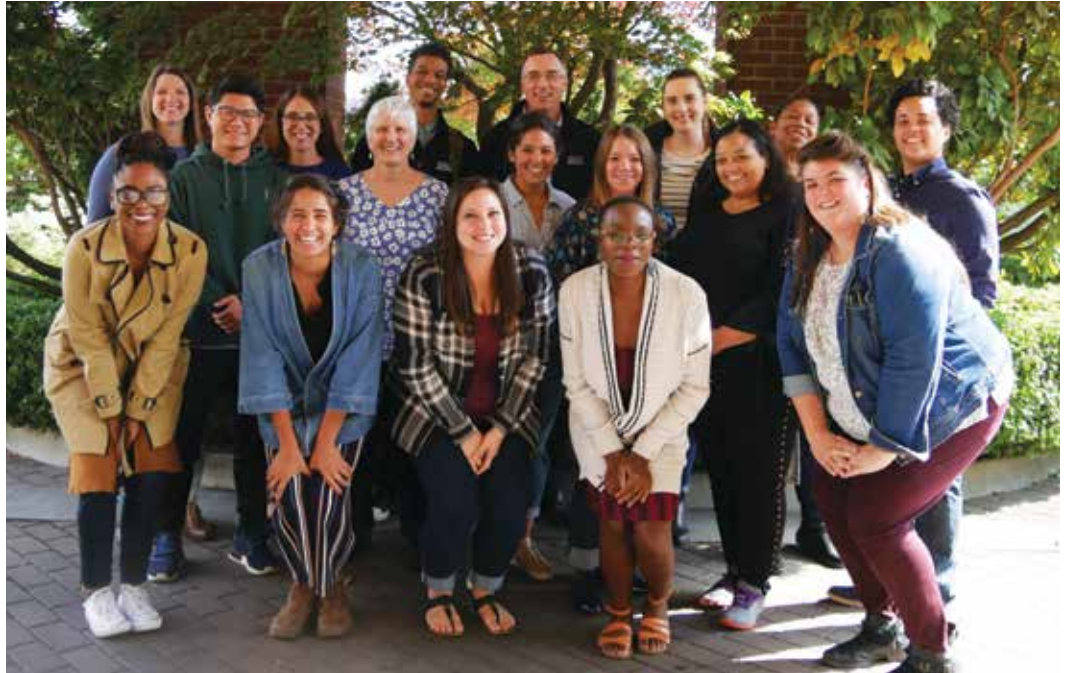
Center for Community Engagement staff