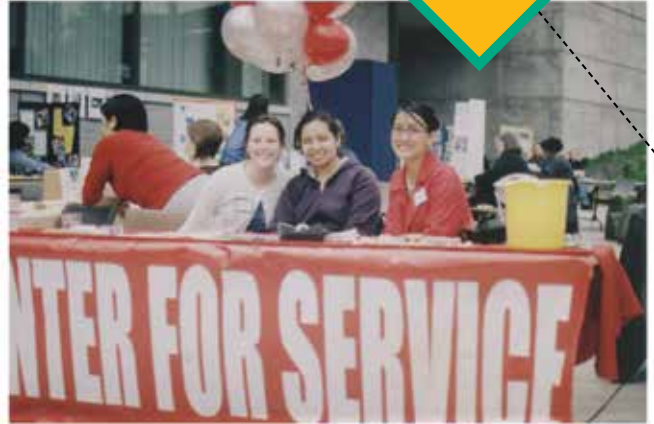
The Center for Service is created—later renamed the Center for Community Engagement

The center hosts the first Shinnyo-en Fellows with support from the Shinnyo-en Foundation, CCE's longest supporter.