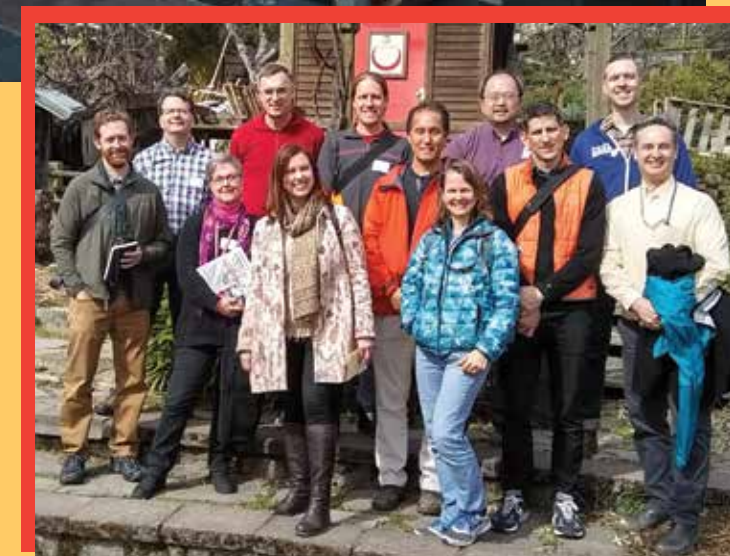
Science and Engineering faculty joined CCE staff for a community immersion to meet possible project partners including the Danny Woo Garden in the International District.