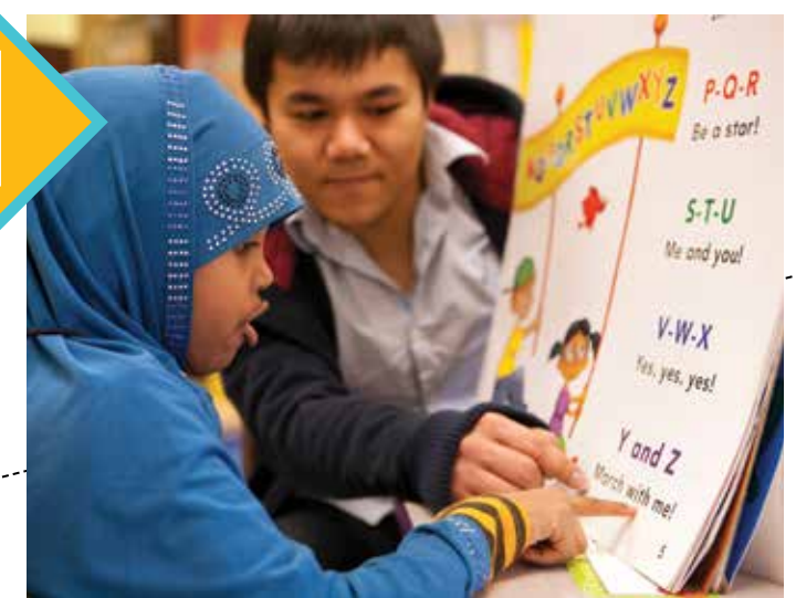
The center hires the first Bailey Gatzert School Success Coordinator, community-based staff person to oversee our efforts in day-time and afterschool programming with elementary youth.