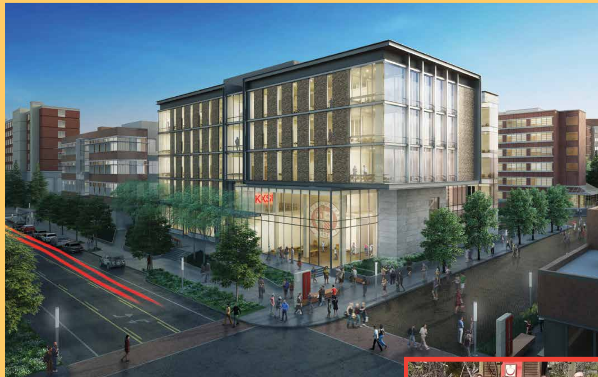
Center for Science and Innovation rendering design by EYP/Mithun.

CCE is poised to deepen its existing relationship with the College of Science and Engineering through a planned relocation to the new Center for Science and Innovation. The center will occupy a prominent 2,300 square foot storefront space facing 12th Avenue.