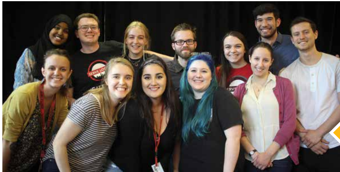
Washington Middle School Mentors

Research shows that just one positive relationship with a caring adult can make all the difference to an adolescent's academic success and belief in their own ability to accomplish goals and deal with life's challenges. The Redhawk Academic Mentoring Program (RAMP) at Washington Middle School, part of the Seattle University Youth Initiative, fosters such connections between a diverse population of middle schoolers and trained Seattle U undergraduate mentors.