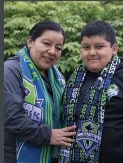
These family portraits were taken by Seattle U photography students during a STEAM Ahead trip to a Sounders game. STEAM Ahead is a Youth Initiative Family Engagement Program that connects Bailey Gatzert families to Seattle's science, technology, engineering, arts and culture events.

Strengthening Families, a keystone of the Seattle University Youth Initiative (SUYI) Family Engagement Program, works with parents and guardians and their 10-to 14-year-old youth to navigate the transition from elementary to middle school.