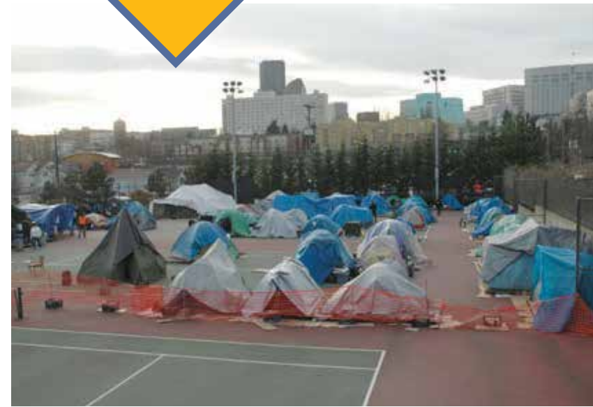
The center hosts Tent City 3 in collaboration with the Center for Jesuit Education, inviting members of the community without housing to temporarily stay on campus.