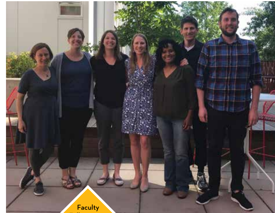
Faculty Fellows 2018