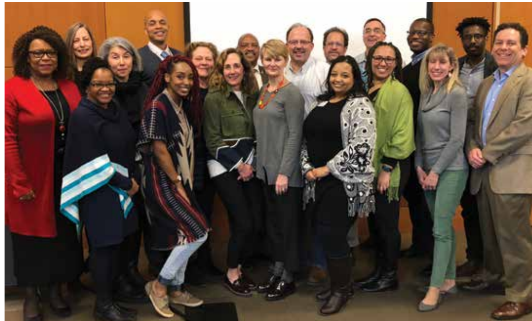
2018 SUYI Advisory Board