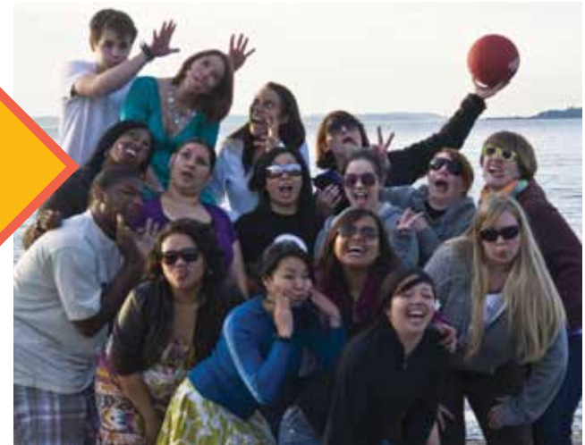
Jumpstart reaches 100,000 service hours in 10 years. Read about one stand-out alumni and the impact Jumpstart had on all four year of his time as an undergraduate at Seattle U on page 6.